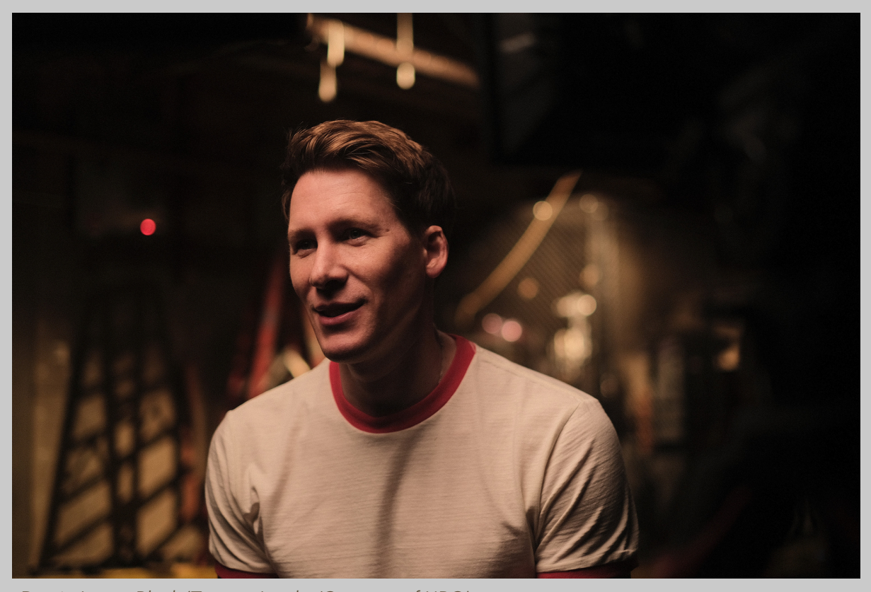
Dustin Lance Black

"It's getting harder to get in the same room with people you love but disagree with."